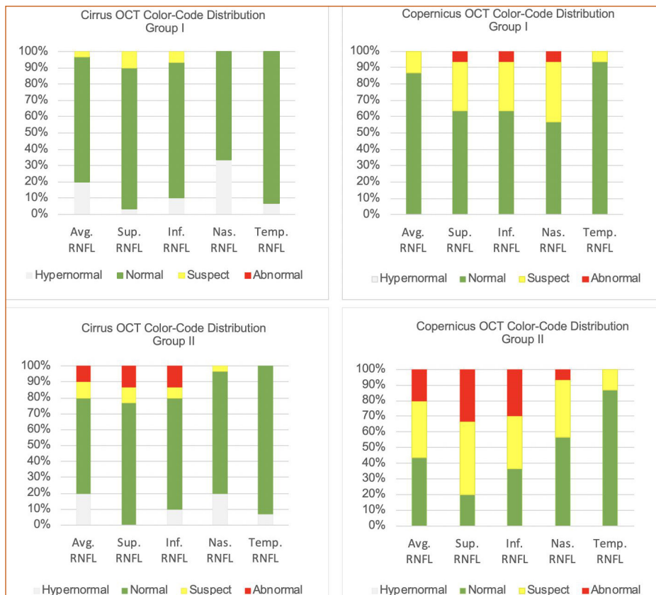
Figure 2: Distribution of color-codes created by Cirrus and Copernicus optical coherence tomographies in patients with glaucoma suspect (Group I) and early glaucoma (Group II)

RNFL: Retinal nerve fiber layer; OCT: Optical coherence tomography