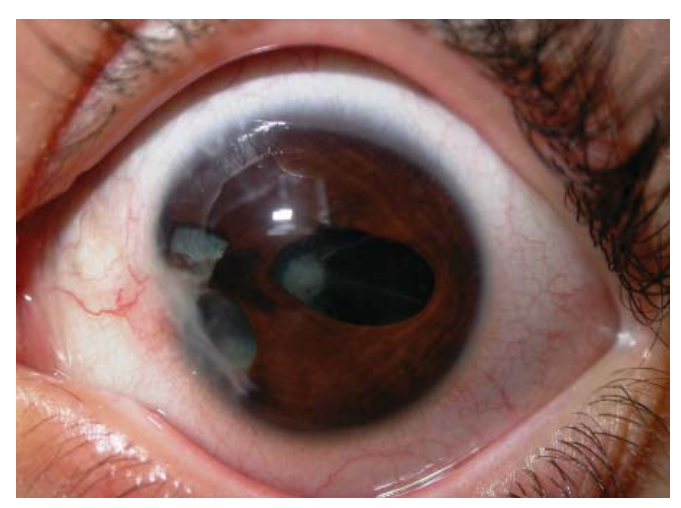
Figure 3: Appearance of the left eye in the late postoperative period.

structed should be made a little smaller in length than the desired length. We also suggest to form a pupilla with an axis perpendicular to the traction lines to prevent the unusual shape of the pupilla and give it a round shape.